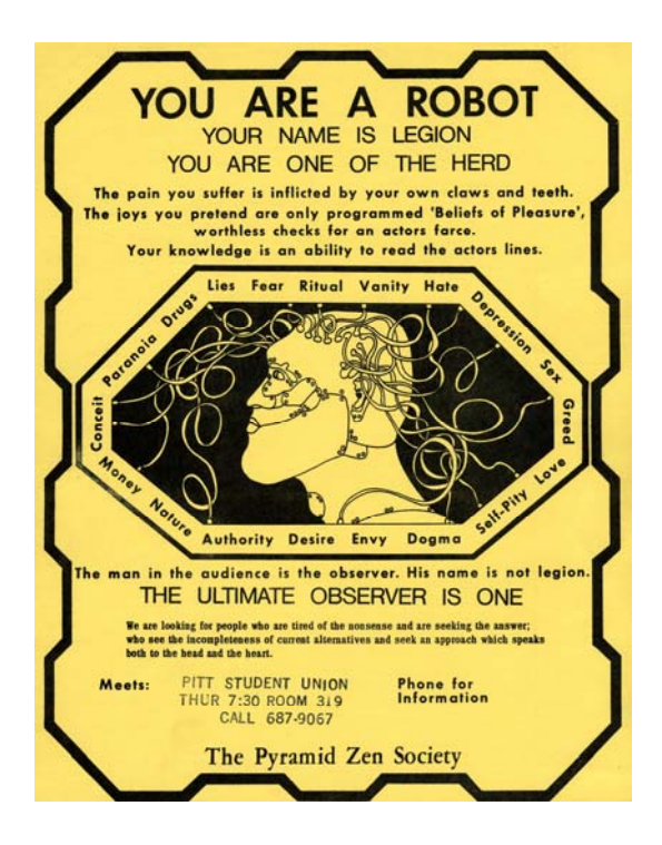
One of the early posters from the 1970's lecture circuit.

continually thrashing around finding what the voice of the populace is...."